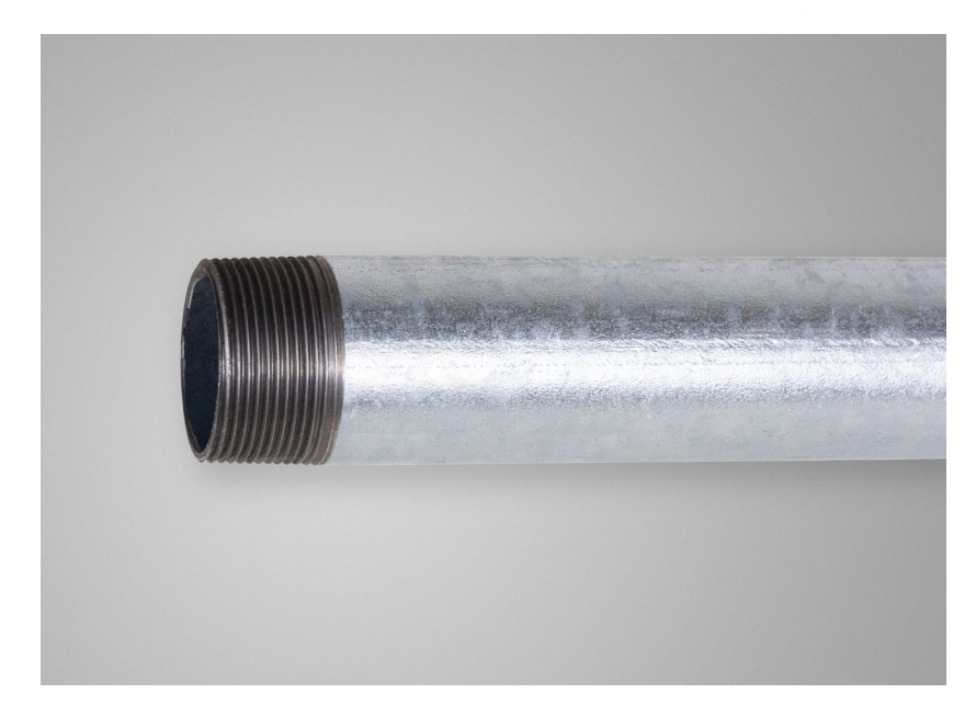
Fabricated Standard & Extra Heavy Pipe is intended for mechanical and pressure applications and is also acceptable for ordinary uses in steam, water, gas and air lines.